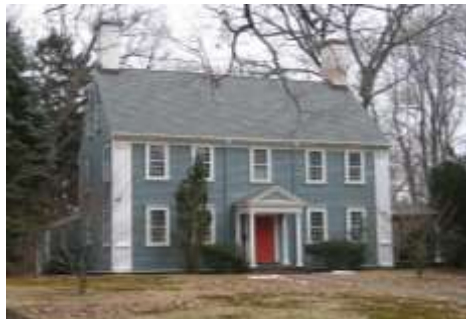
4 Oakland Street

About a week before the meeting, you will receive a copy of the meeting agenda. If your application was filed in a timely manner, it will appear on the agenda under "Public Hearings."