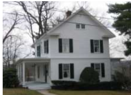
18 Broadview Street

To assist it with carrying out its responsibilities, the Commission has developed and adopted a set of design and materials guidelines that are used to help the Commission decide upon the appropriateness of activities proposed within the District. The guidelines are also intended to help residents of the District understand the Commission's general preferences as it reviews proposed changes.