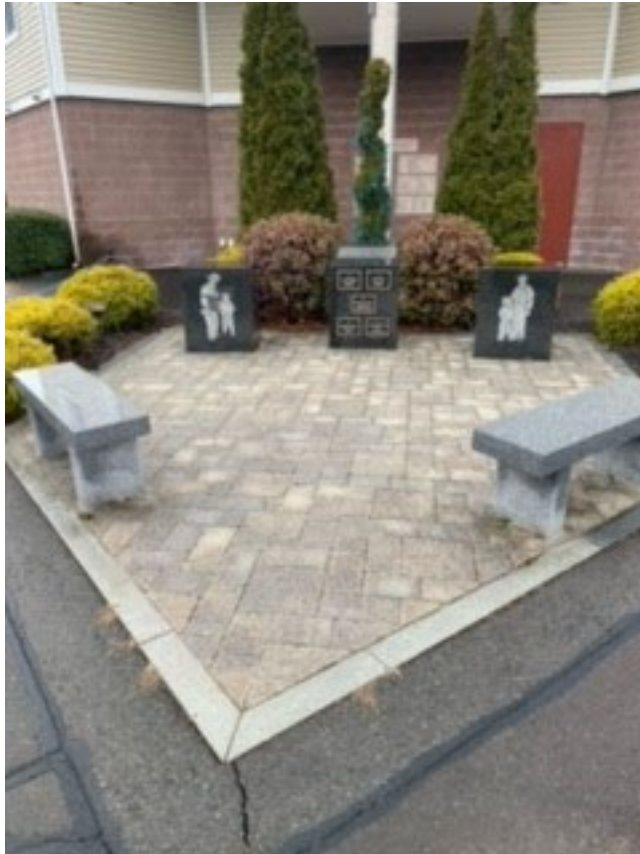
911 Memorial at Edgewood LL